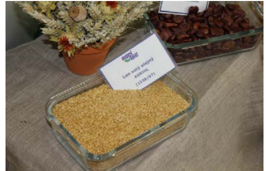
Seed yield 2014, 2015